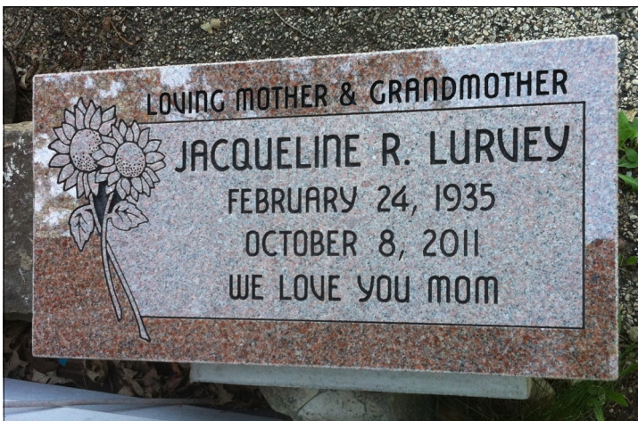
Newest flush monument on the Rienzi grounds

Rienzi offers a full-service monument business, only for property owners at Rienzi. We work with Blast Craft Service, Inc. out of Slinger, Wisconsin.